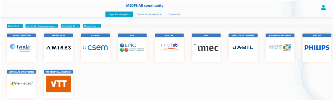
Figure 4. Current view of the catalogue with the registered organizations (Organization registry).